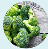
VITAMIN B5 (PANTOTHENIC ACID)